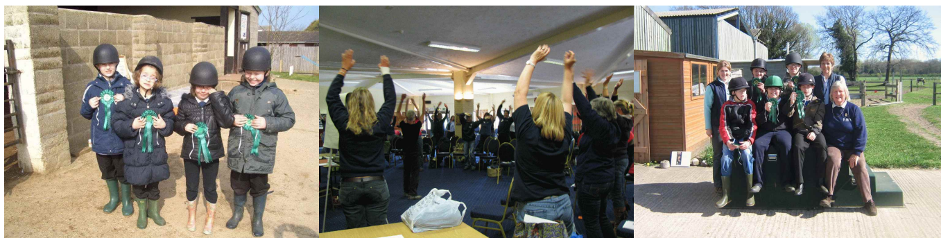
Left: Children from the North Norfolk Group, with their rosettes, who have just ridden at the Shire Horse Centre in Runton.